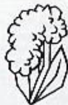
▲ Cirus cotton