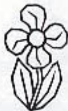
▲ Garland of Elegy