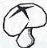
▲ Moutain bulb