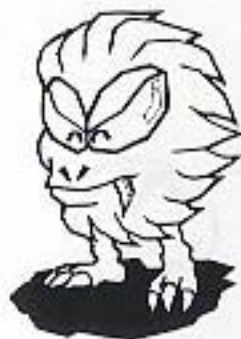
▲ Wooly Sprite