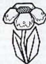
▲ Pippo's Heart