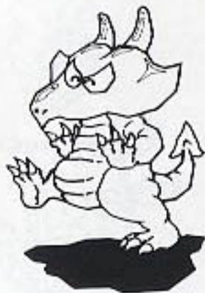
▲ Snapping Dragon