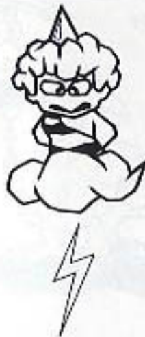
◀ Thunder Rap

Your only ally. He is pitched from the back of Kid Kool at the enemies.